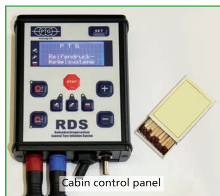
Cabin control panel