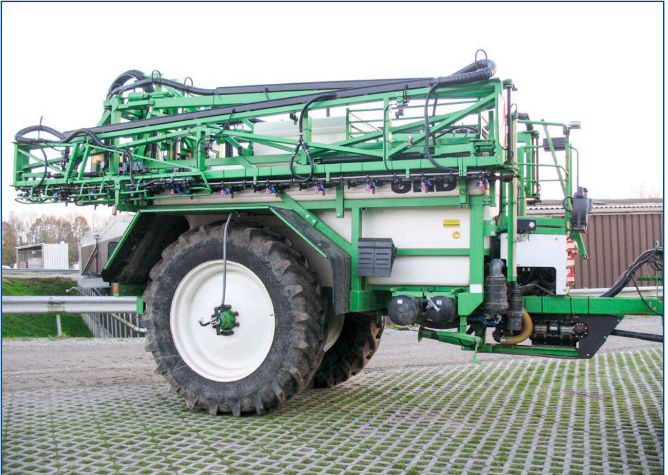
AIRBOX/drive 2L with digital control Dual line tyre inflation system for pulled field sprayer